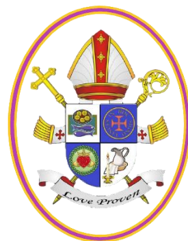
Official Seal of the Council of Bishops Progressive Catholic Church International